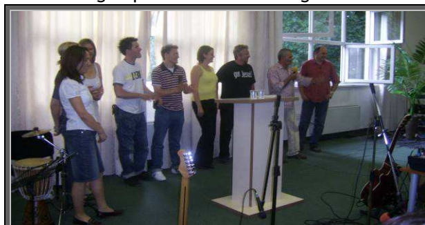
The group from Serbia visiting Croatia